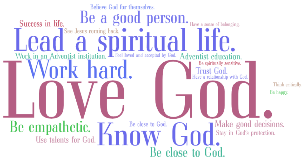
Figure 6: Parents' hopes and dreams for children

Parents' fears for their children (shown in Figure 7 and in the quotes below) were largely homogeneous and had to do with children losing their relationship with God and losing eternal life because of life's preoccupations and distractions.