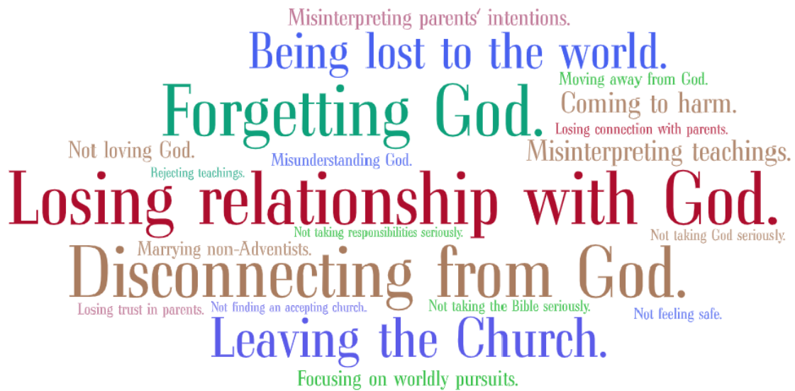
Figure 7: Parents' fears for children

"My fear is that they should not get so busy in this world. The world is so busy with all the media and social media and things like that, even work, that can separate them from God without their knowledge."