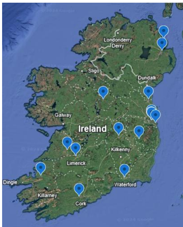
Figure 2: Participants' locations of church attendance

Aside from culture of birth and upbringing, we also anticipated that other factors such as other cultures, education, age and life experience would have also had an impact on parents' worldviews and parenting styles. As such, to ensure broader representation, we drew participants from churches in different areas within the Irish Mission including Ballinacrow, Belfast, Cork, Drogheda, Drumcondra, Dublin, Larne, Limerick, Longford, New Market on Fergus, Portlaoise, Ranelagh, Tralee and Waterford as depicted in Figure 2.